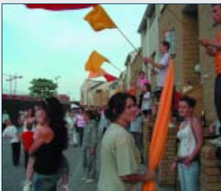
Celebrating: A festive occasion in Fatima saying goodbye to the old flats and welcoming the new houses and apartments