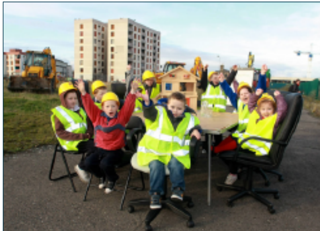
Although modest by comparison to the original plan, the new development is given the thumbs up by the next generation from St Michael's Estate