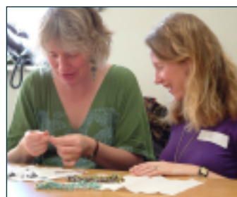
Jewellery Making has proved to be a very popular course choice

A further series of courses will run in 2011 including a 10 week Modern Line Dancing course beginning Monday 17 January 7pm to 9pm in St. Michael's Parish Centre, Emmet Road, Inchicore and will cost €5 per night.