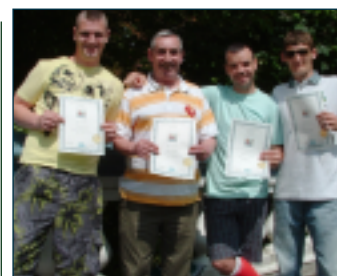
Men from the Hey Da! programme

This year has proved to be a good year for groups from the Partnership area who are working to support men who want to